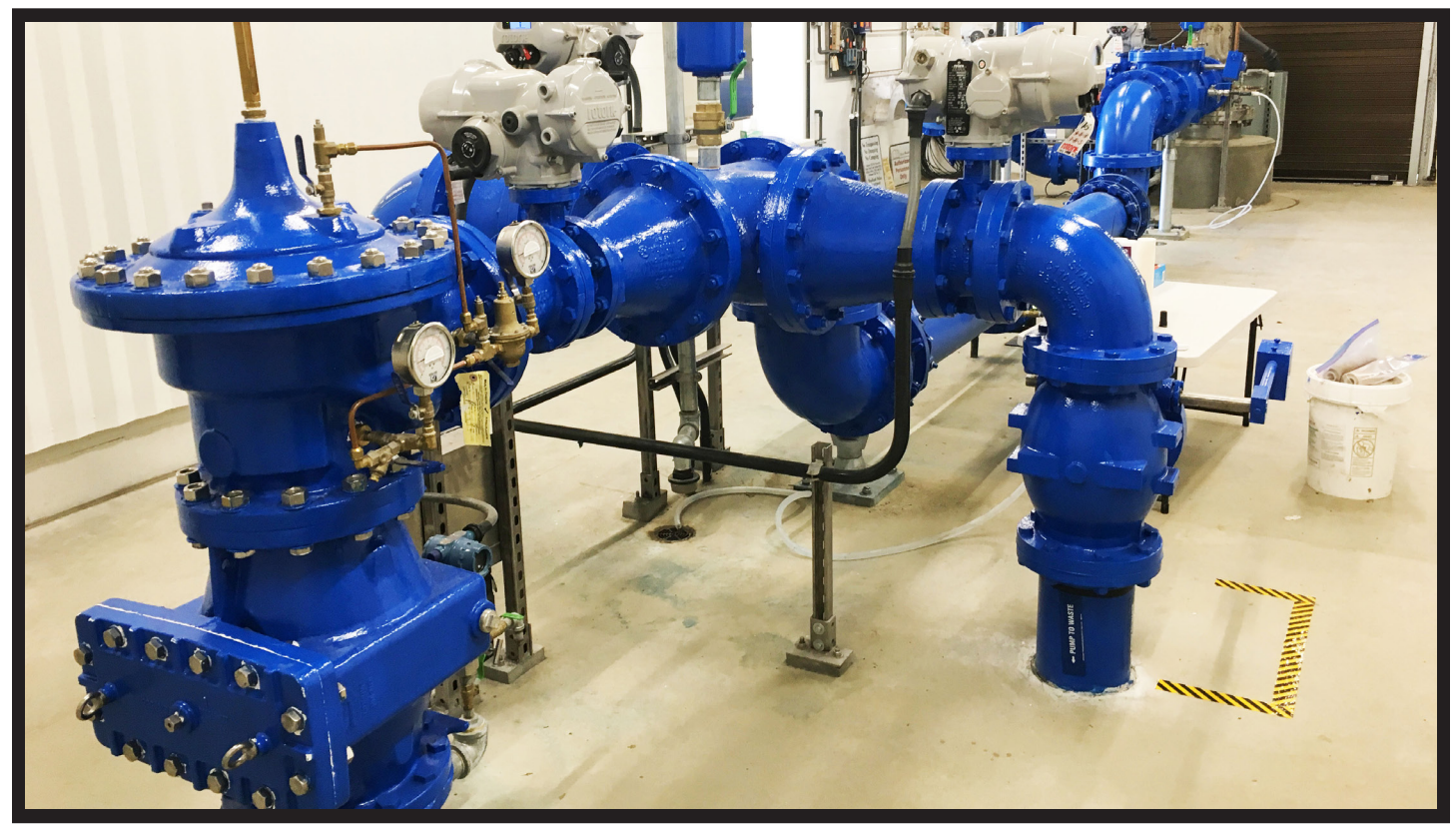
2019 ACEC California's EEA Golden State Winner: Woodland Aquifer Storage and Recovery Wells #29 and #30 (Carollo Engineers, Inc.)