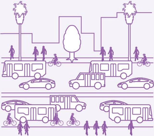
Many more people moving smoothly when we make better use of street space