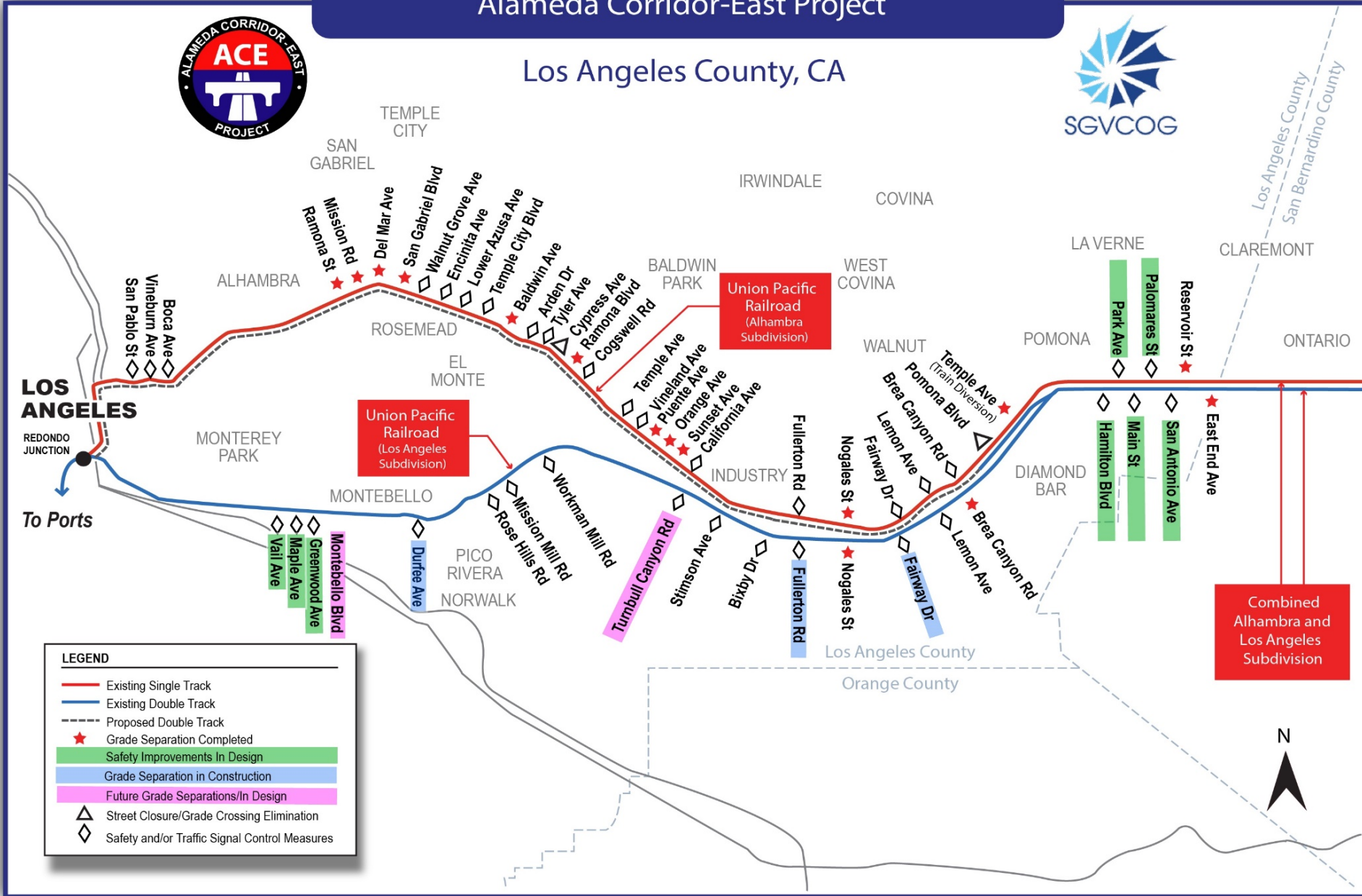
Alameda Corridor-East Project Area